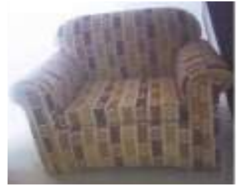
One seater sofa (finished)