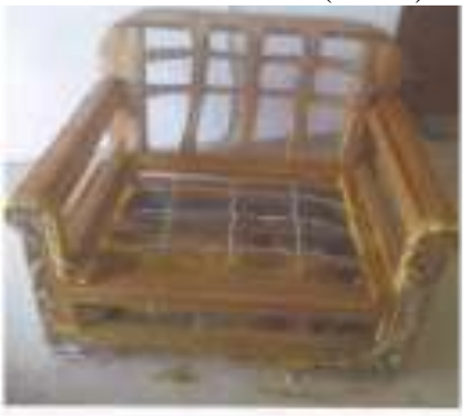
One seater sofa (frame)